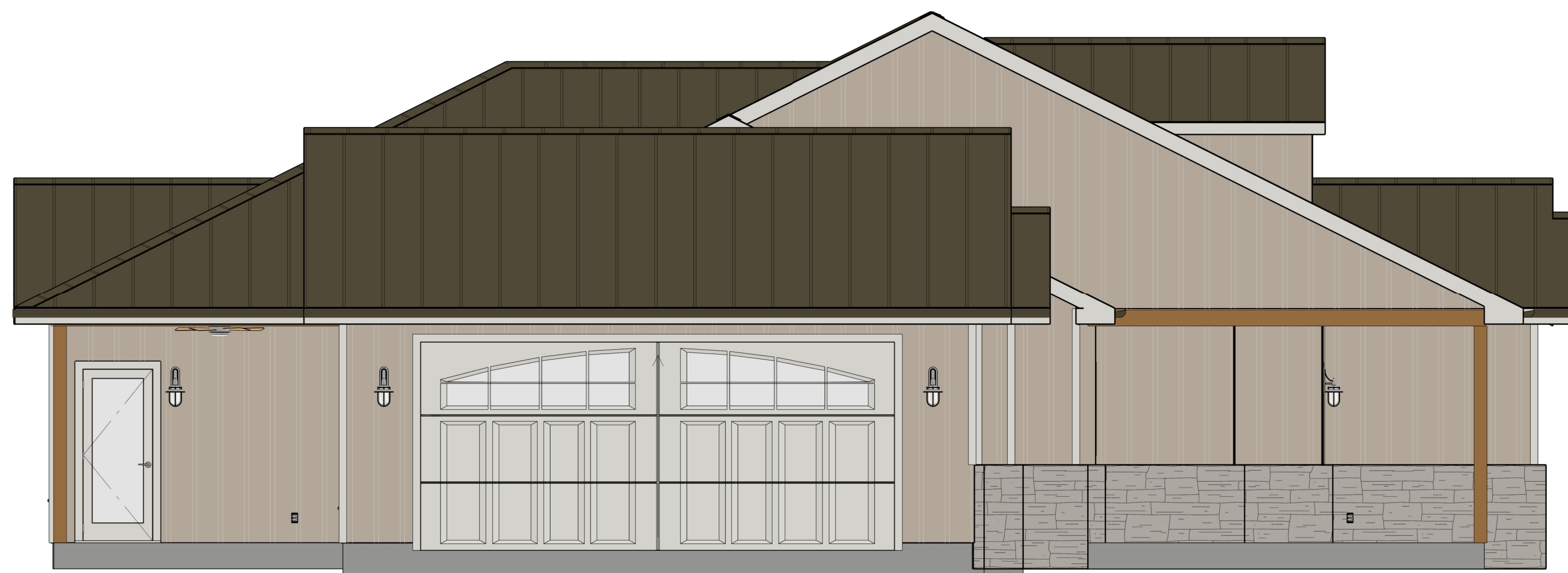
Exterior Elevation Left