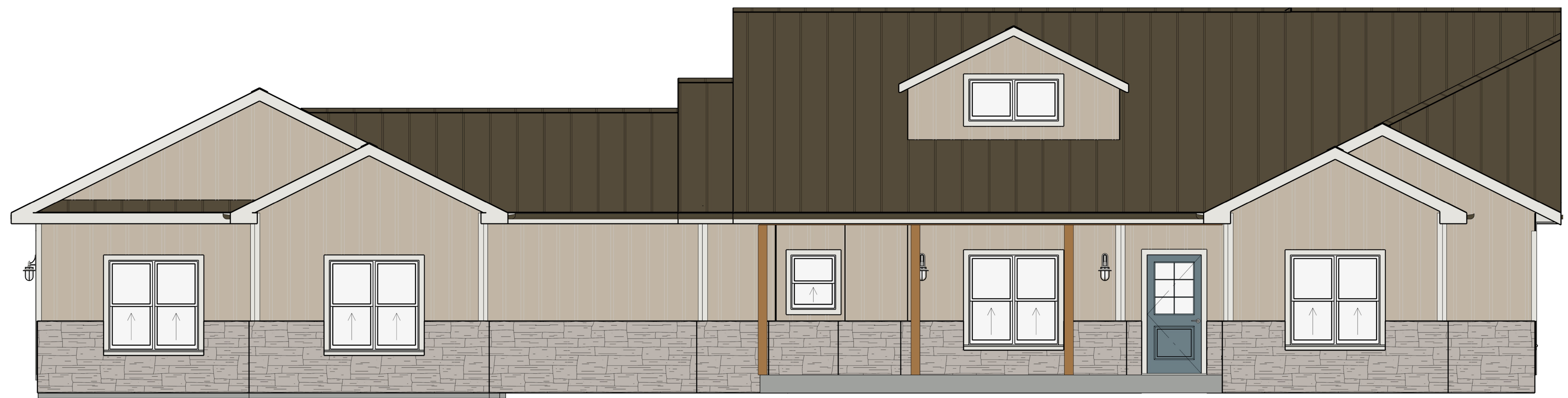
Exterior Elevation Front