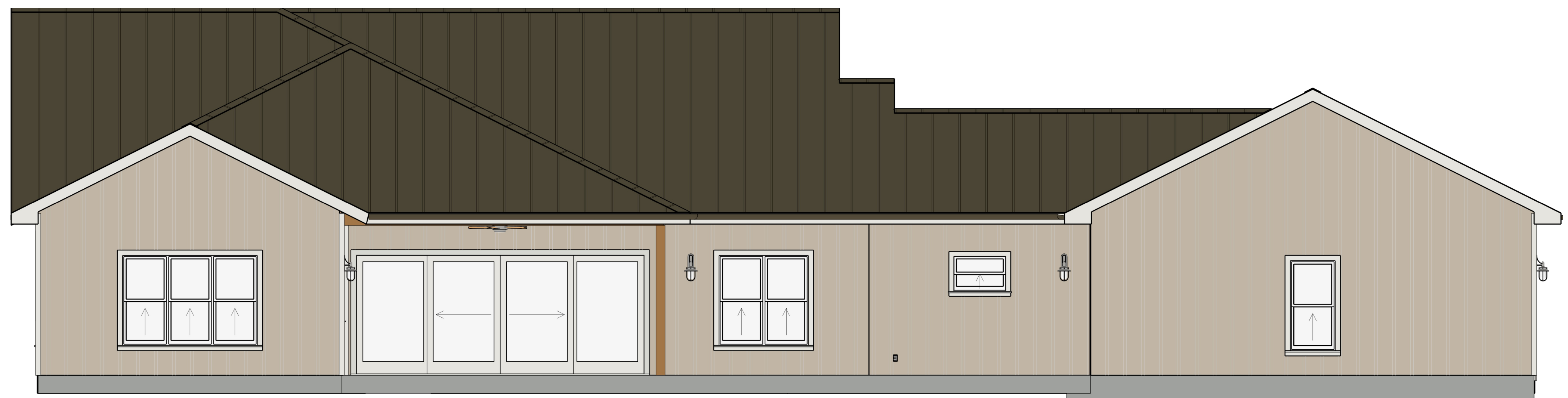
Exterior Elevation Back