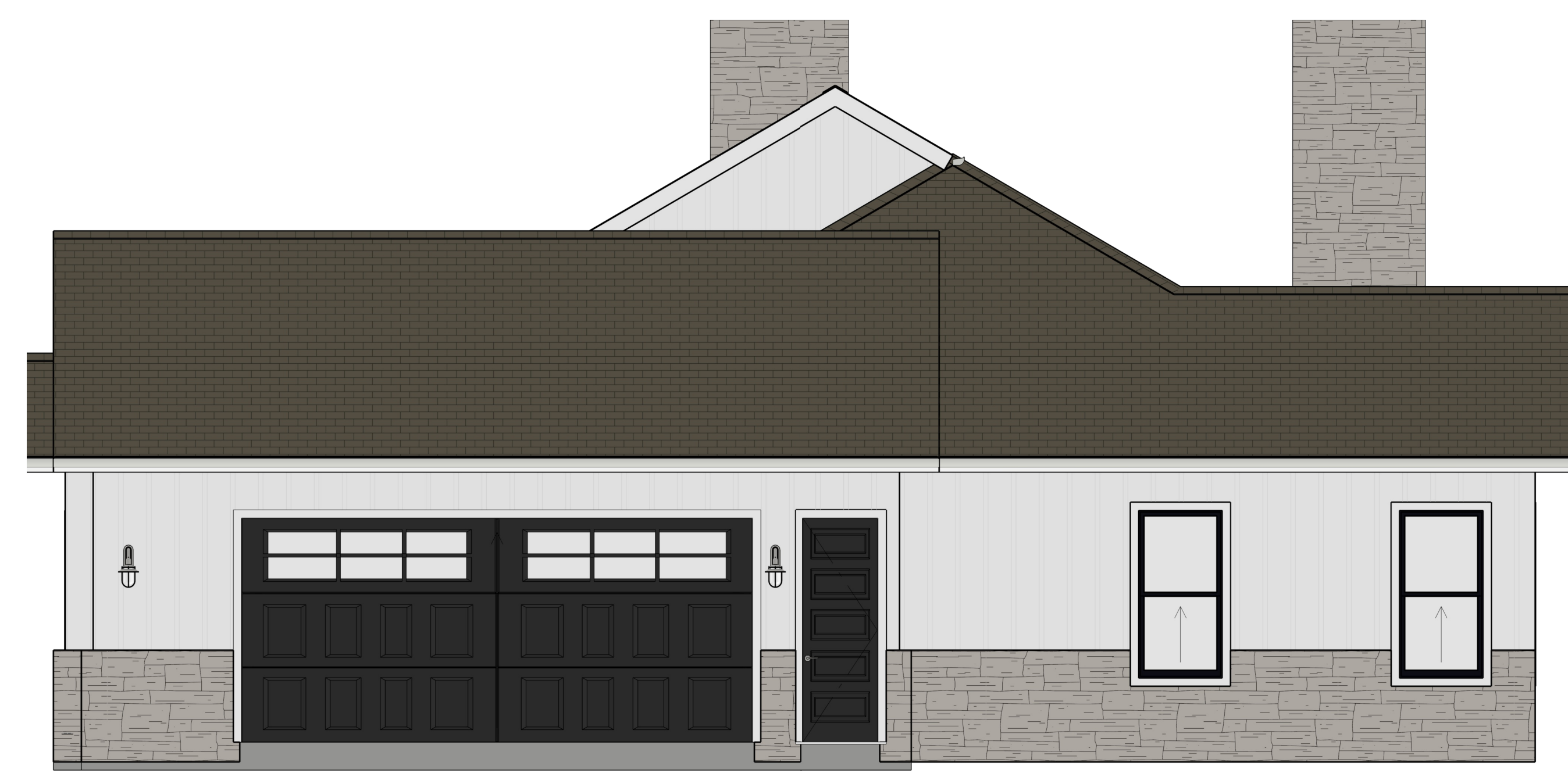
Exterior Elevation Right