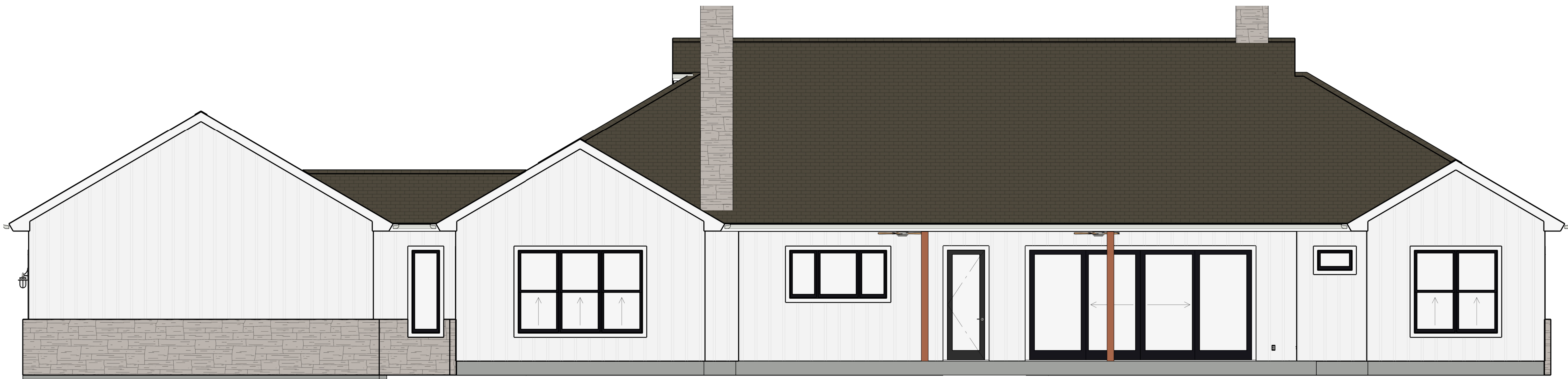
Exterior Elevation Back