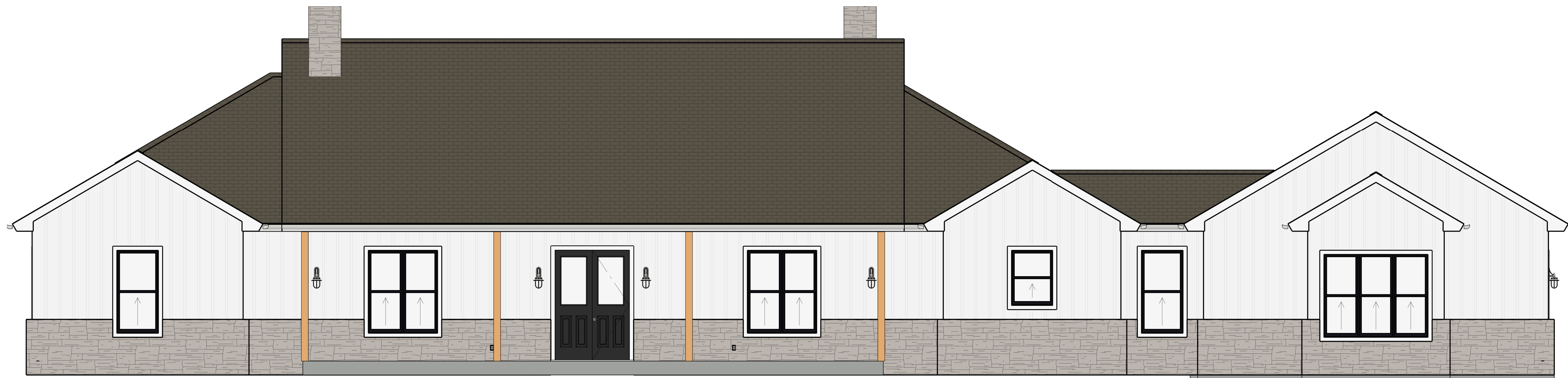
Exterior Elevation Front