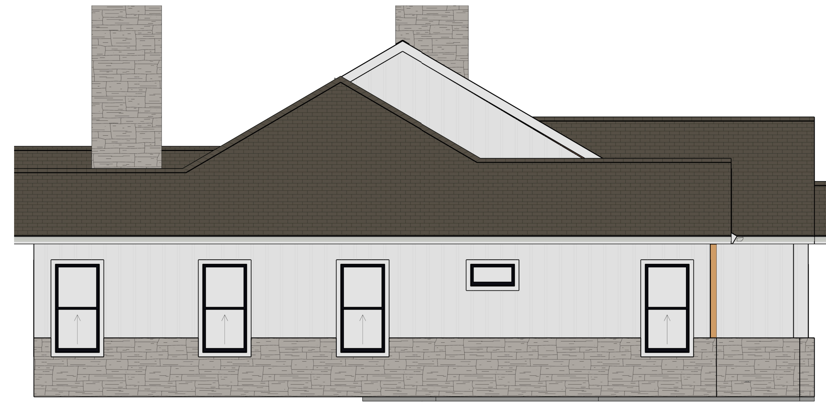
Exterior Elevation Left