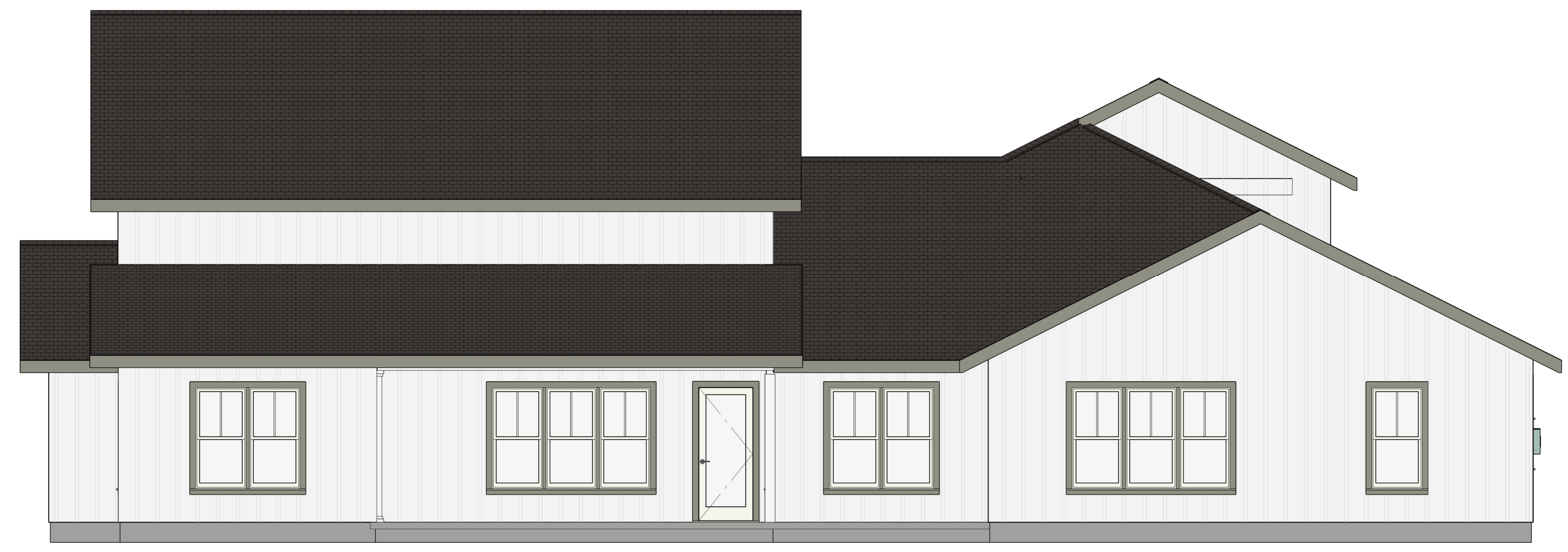
Exterior Elevation Back