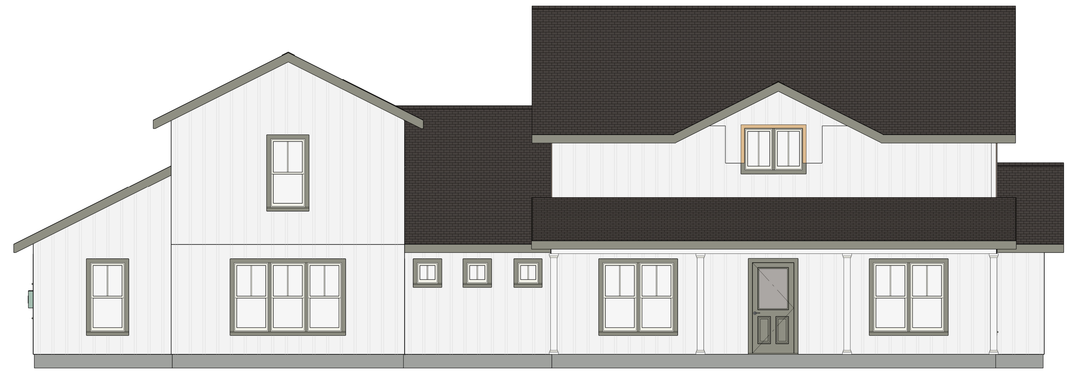
Exterior Elevation Front