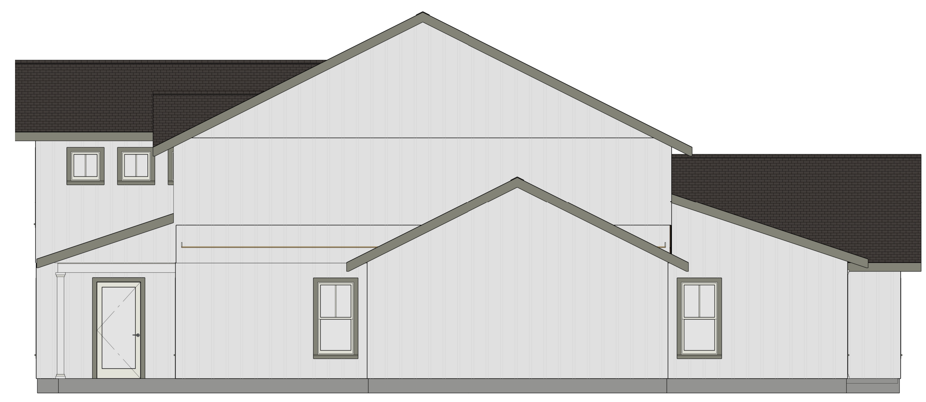
Exterior Elevation Right