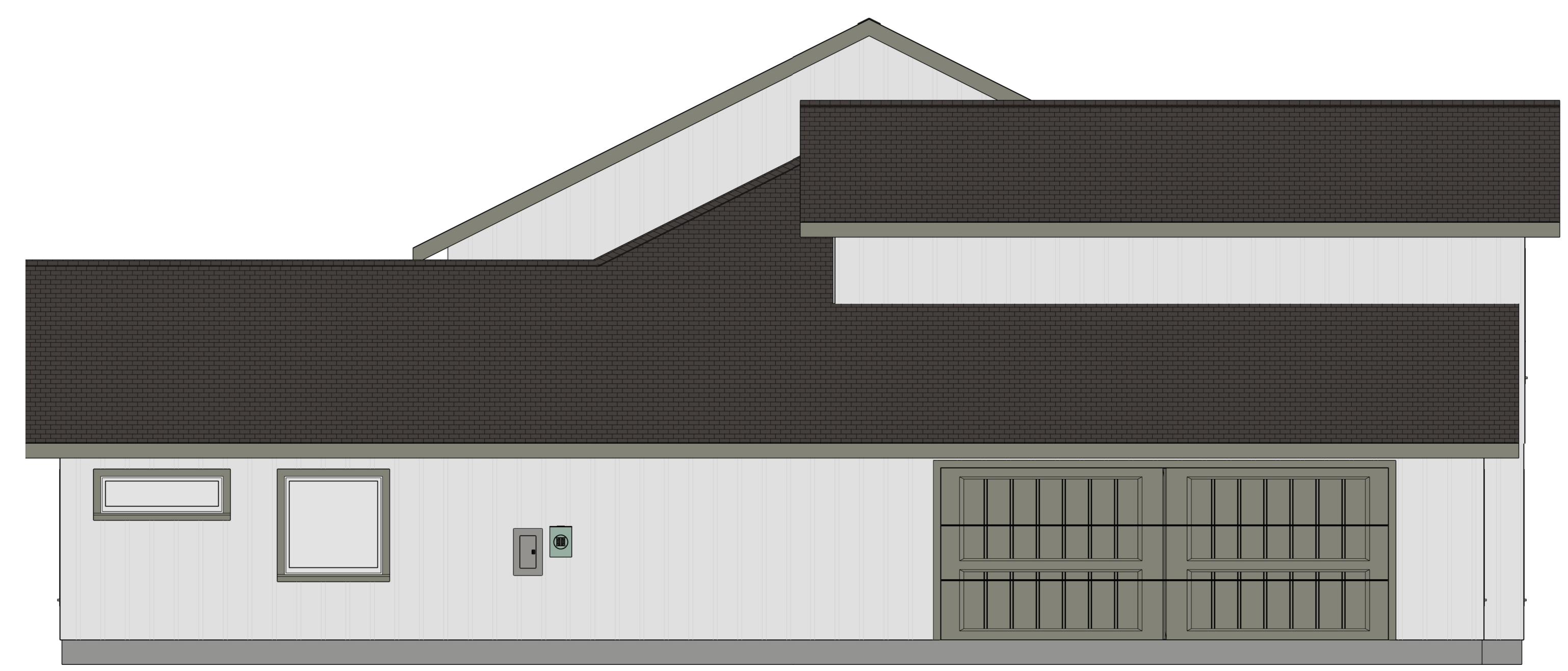
Exterior Elevation Left